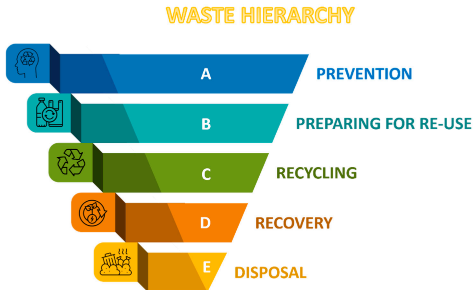
Figure 1. Waste hierarchy inverted pyramid.

resource efficiency. The hierarchy is presented as an inverted pyramid of the main options to be adopted before a material becomes waste for reuse and/or as the extension of products' life, and disposal at the bottom as the last choice for waste management (Figure 1).